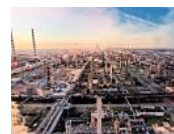
Elon Musk predicts a population implosion